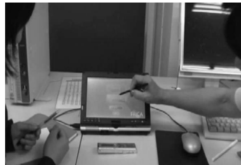
Figure 5. Dialog scene