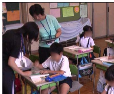
Figure 3. Recording scene