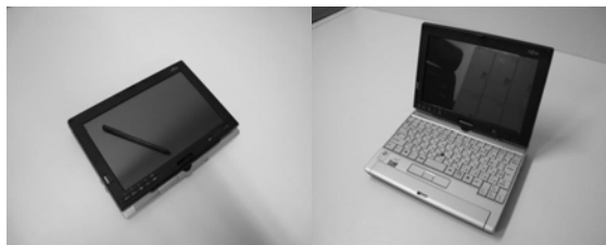
Figure 1 . Hardware

FRICA is a system enabling an experienced teacher to record children in a class taught by a novice teacher, and then both teachers reflect and discuss the contents of the class by watching the film. The system enables mentoring which focuses on the children in class. FRICA was developed using Microsoft Visual C#. A small and light tablet PC with a control-pen is used in order to reduce the teachers' burden of using a heavy PC or a mouse for recording. FMV LIFEBOOK FMV-P8240 (Figure 1) and a web camera were utilized. FRICA includes two modes: