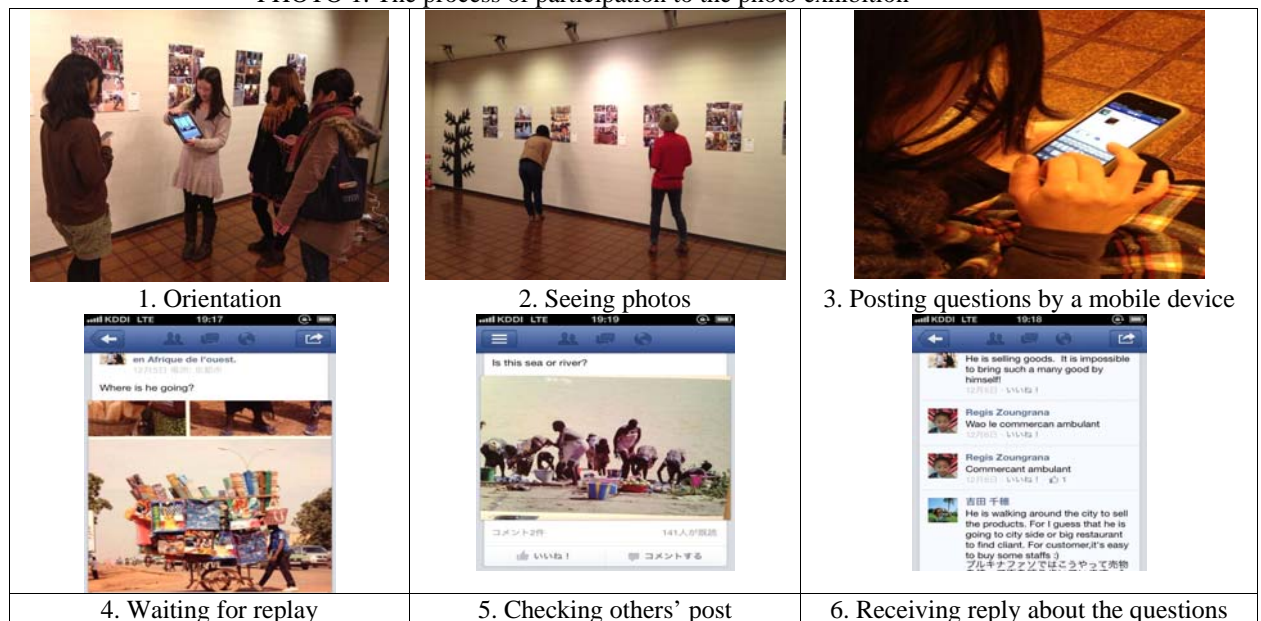
PHOTO 1. The process of participation to the photo exhibition

The procedure to participate the photo exhibition has six steps. First, the visitor received orientation from authors as staffs. Second, the visitors looked around in the exhibition with thinking questions based on photos. Third when the visitor found the picture that they got interested in ,or they had a question of it, then they took a picture and posted it through facebook with questions using a mobile device. Fourth, they waited for the reply about their questions from those who concerned with West Africa for a few days. Fifth, the visitors check the answer through the facebook. At the time, they could see other’s post on facebook. At last they received the answers about their questions. The information gotten newly by visitors was displayed in the exhibition day by day.