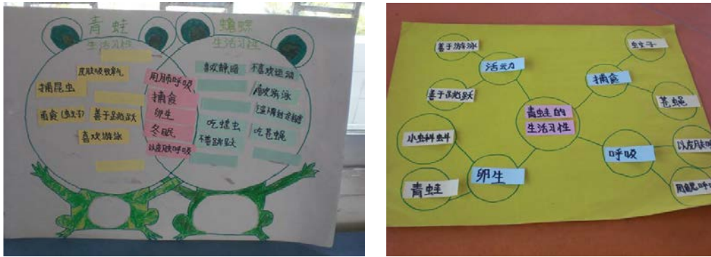
Figure 1. Students complete mind maps